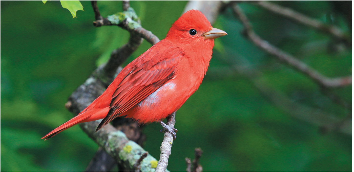
Summer Tanager (Pirangra rubra)

each spring, laying on new wood and opening buds. A few lines from the poet Mary Oliver come to mind.